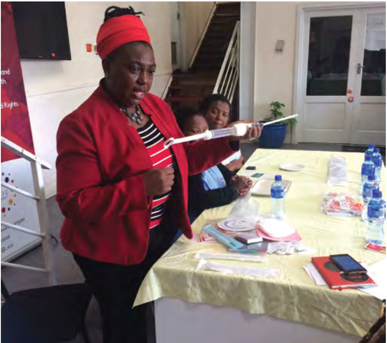
A member of the Sexual and Reproductive Justice Coalition in South Africa demonstrates the surgical abortion method at a panel on safe abortion, September 2017

The convening participants discussed that there should not be any accommodations for “conscientious objection” claims in health care laws and policies. (See section III for policy recommendations.) They also developed recommendations and strategies for the health sector.