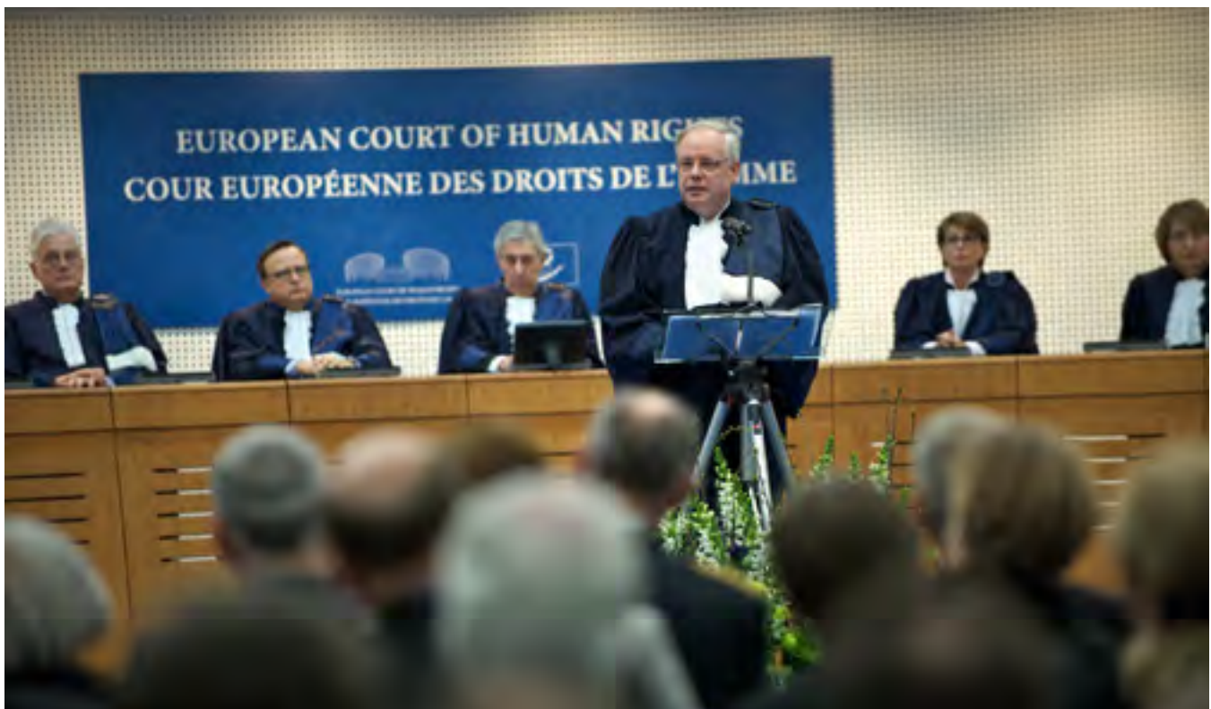
European Court of Human Rights.

In a collective complaint case, FAFCE v. Sweden , the Federation of Catholic Families in Europe (FAFCE) argued that Sweden had failed to protect the right to health, asserting that the guarantee to claim "conscientious objection" is necessary to promote the health of health care workers. They also argued that Sweden was violating health care workers' right to non-discrimination, because the government had not established a regulatory framework allowing them to refuse to provide abortion services by using conscience claims. Under Swedish law, health care providers have a duty to provide abortion; although health care institutions may choose to exempt an employee from performing abortion, exemption is not an entitlement.