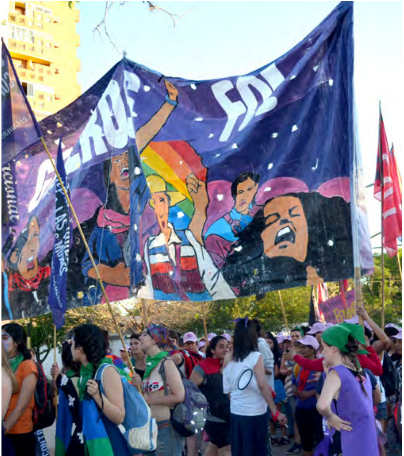
In October 2017, more than 70,000 women from across Argentina convened for the Encuentro Nacional de Mujeres or "National Women's Gathering" to mobilize on a range of women's issues and march through the streets.