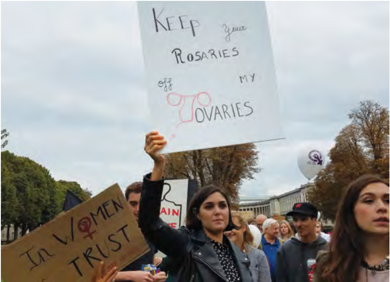
At the March for Safe Abortion in Brussels on September 28, 2017, International Safe Abortion Day

Reproductive justice is a useful organizing framework for developing a strategic response to the negative effects of conscience claims by health care providers. Coined by a women of color organization in the US, 83 reproductive justice is defined as the human right to maintain personal bodily autonomy, have children, not have children, and parent one's children in safe and sustainable communities.