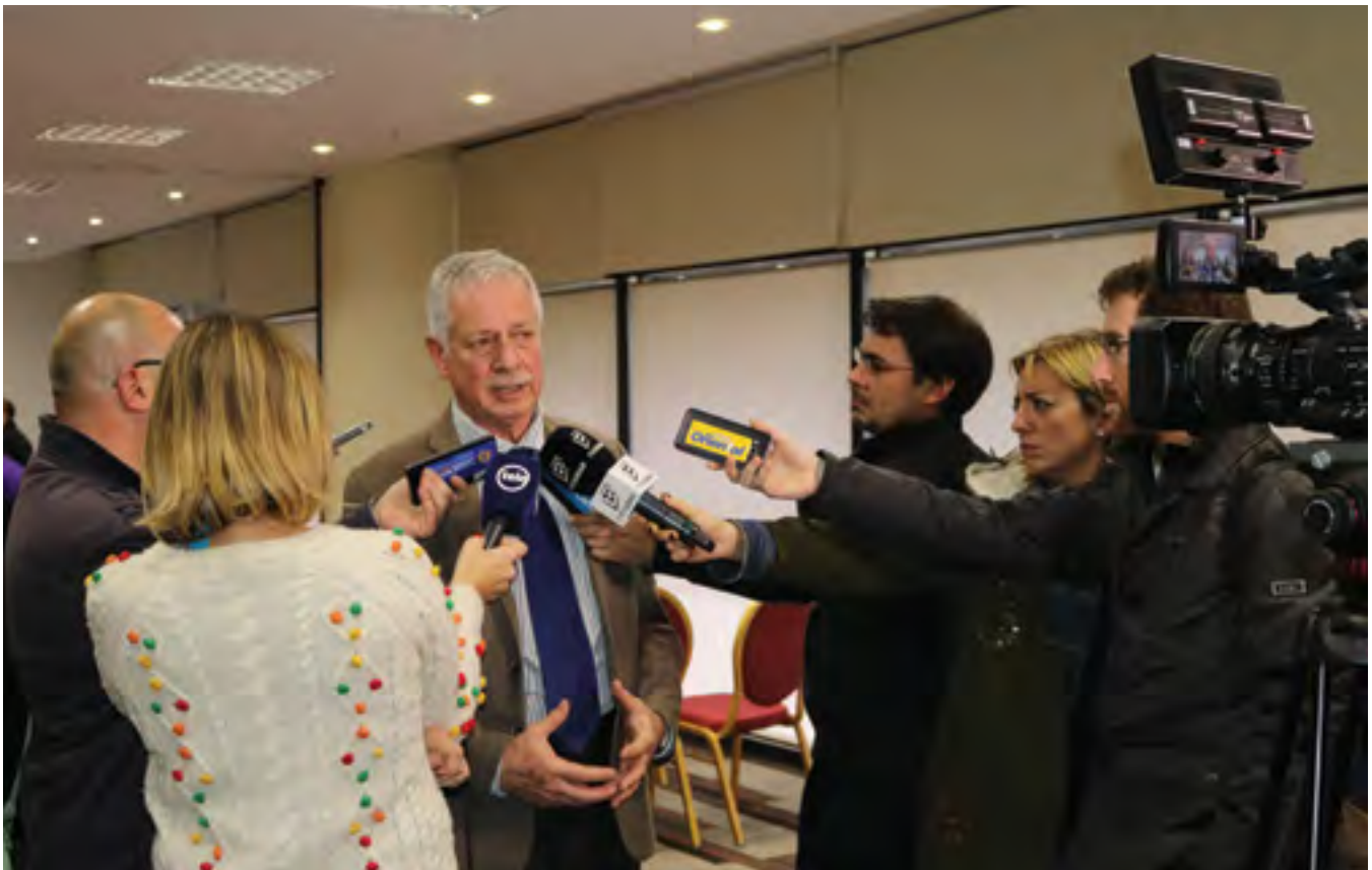
Jorge Basso, Minister of Health of Uruguay, speaks to reporters at the Convening on Conscientious Objection, August 2017

While convening participants did not come to a consensus, the majority recommended that—given the difficulty of enforcing regulations—laws and policies ought to avoid any mention of "conscientious objection." For countries where abortion laws are under review or revision, advocates and allied stakeholders should strive to draw attention to the consequences of refusal to provide care, ensure that they do not use the term "conscientious objection," and do not allow exceptions for health care providers to refuse to provide care based on personal beliefs. Where laws already exist, provisions may need to be made for health care professionals already in service while preparing the next generation of providers to think differently about balancing personal beliefs with professional and ethical obligations. At the same time, advocates must hold governments accountable for the provision of high quality and widely available reproductive health services through the enforcement of regulations on conscience claims.